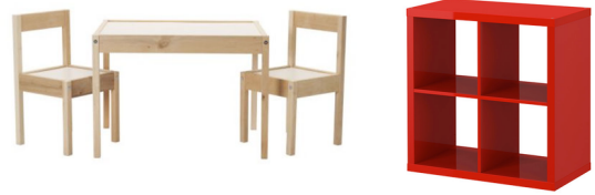
Fig. 2: Pieces of furniture that were used in assembly tasks. (Left) IKEA Lätt table and chairs. (Right) IKEA Kallax shelving unit.

goal of making previously unrelated training data applicable. An agent simulator was then built based on the human task performance data. This simulator, capable of generating agents with a multitude of proficiencies and learning curves based on the observed human data, allowed for the proposed modeling technique to be applied to a much wider and more difficult range of worker types. Finally, we evaluate our system’s performance both on its ability to estimate performance for previously untrained tasks and on its ability to extrapolate agent performance for already known tasks.